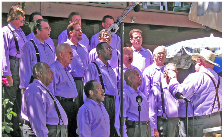
Singing at the Strachan 4th of July event.