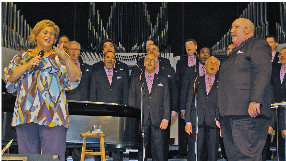
Gospel Singer Sandi Patty and Christian Edition in concert.