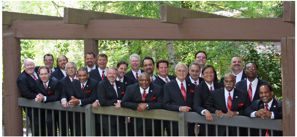
Mount Hermon Christian Conference Center provides a perfect backdrop for this group photo.

On Sabbath morning, Christian Edition provided the worship service for the Campbell SDA Church congregation, and the church members provided a pot-luck afterwards. Then it was time to head on down the road to the Mount Hermon Christian Conference Center in Santa Cruz. What a beautiful campus! No wonder it is a favorite location of the CE members. The afternoon was spent taking photos, one of which you see at the top of this page and many others you will find on our new website and in other promotional materials. Check them out!