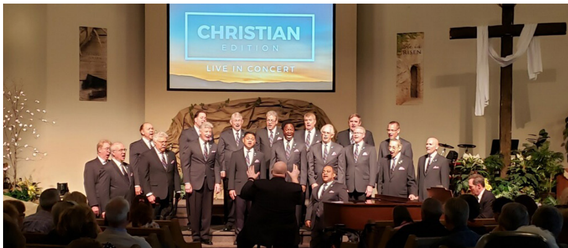
Christian Edition participates in an Easter celebration vespers at the Auburn SDA Church.

Because it was Easter weekend, the empty tomb and what seemed like a thirty-foot towering cross was the perfect backdrop for the Sabbath evening program. These symbols were stark reminders of the death and resurrection of Jesus Christ. From where I sat, I could see the empty tomb. I visualized Christ coming out of the