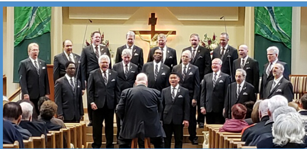
February 16 found Christian Edition leading in the worship service at their founding church, Eagle Rock SDA, thirty-eight years after they first started as the Eagle Rock Men's Chorus. Later in the day they presented at St Anthony's Catholic Church in Upland, California (see photo).

"What's mine is yours; I'll share it." This philosophy of life recommended by Jesus, is very beneficial for members of Christian Edition, and for you too!