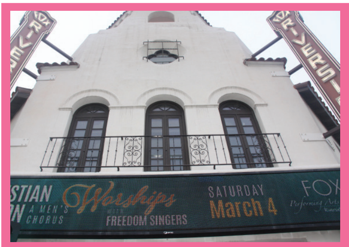
Marquee at the Fox Theater, Riverside in March.

I hope that everyone who worships with CE can feel the joy I feel with the songs we sing! I think my favorite so far, "God Wants to Hear You Sing," tells the power of Christian music to raise human spirit and witness to others about the great God of Song that we can call a friend.