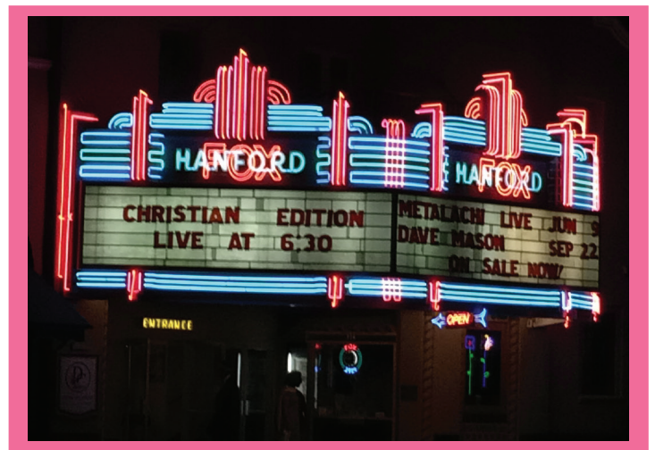
Marquee at the Fox Theater, Hanford in April.