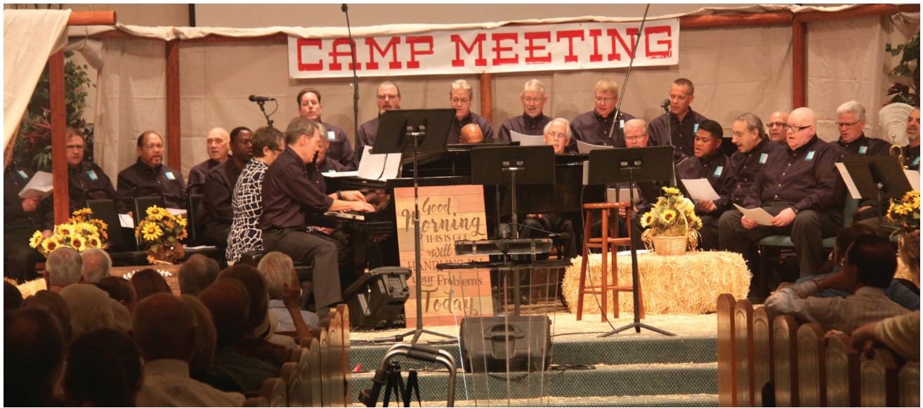
Calimesa, California, Campmeeting in August