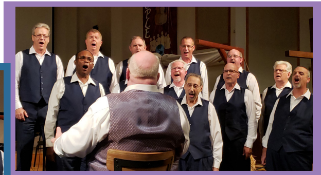
The men of Christian Edition provide a free afternoon concert for the Calimesa SDA Church Campmeeting following their morning participation in the worship service.