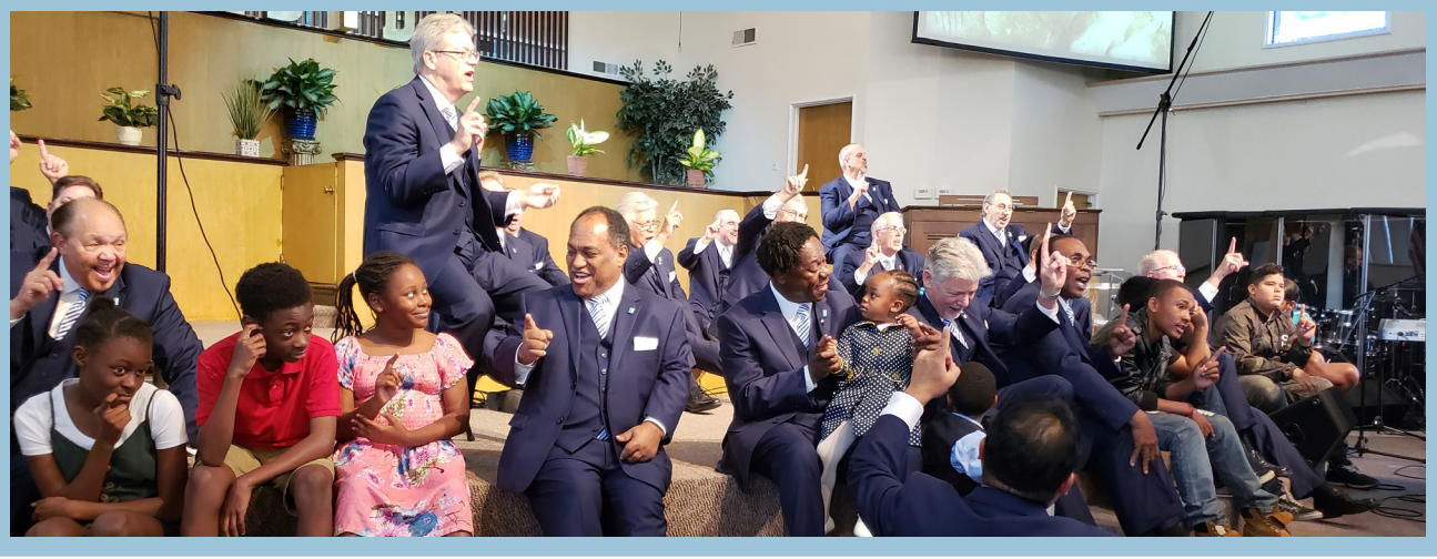
Children at the San Bernardino Community SDA Church join the men of Christian Edition in a children's medley of songs.