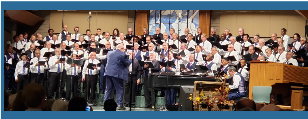
Bay Area Men's Chorus, Carmichael Men's Chorus, Christian Edition Men's Chorus and Modesto Praise Men's Chorus join forces in a festival of praise music.